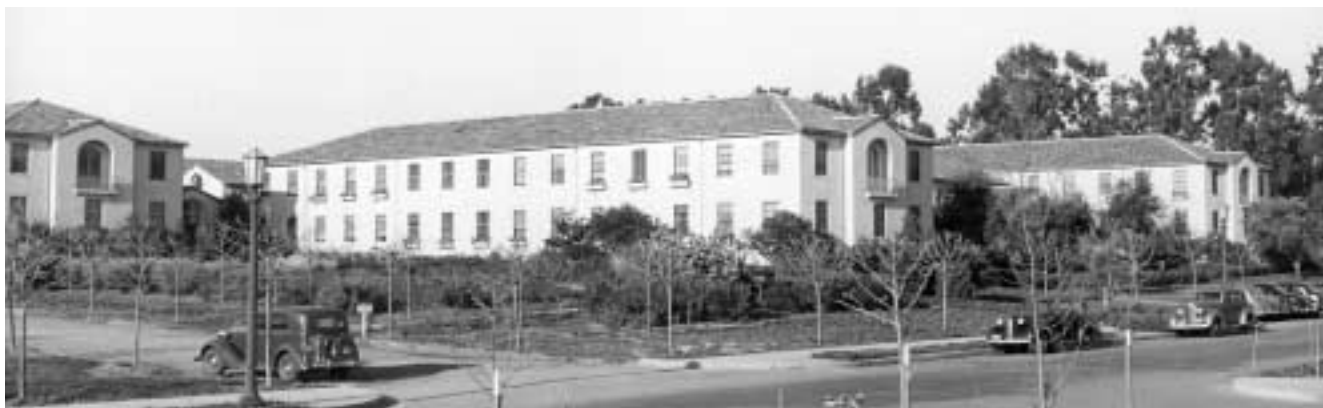
Lagunita Court, circa 1940. "The whistle, which Lagunita had been too distant to hear, had blasted Encina to deafness."