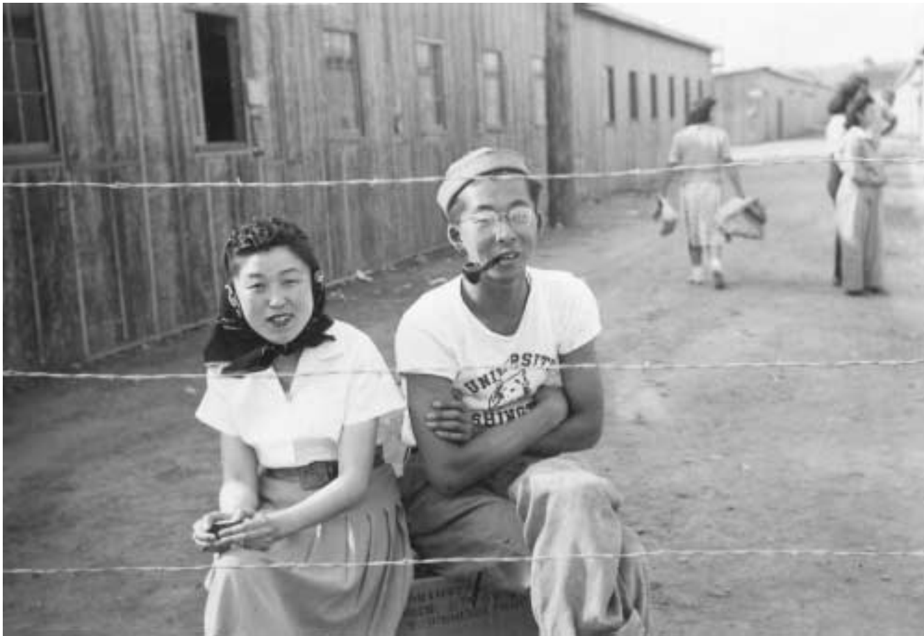
Thomas Bodine's photographs, taken as he toured relocation camps for the National Japanese American Student Relocation Council, were meant to be thought-provoking. He labeled this photo of two college students: "American Citizens: behind barbed wire in the U.S.A."