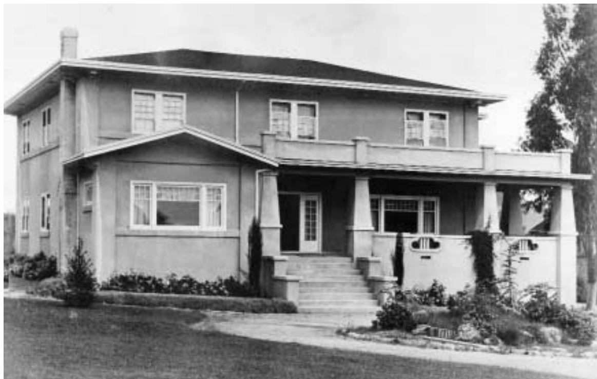
The Japanese Student Association Clubhouse, built in 1916 at 420 Santa Ynez Street.