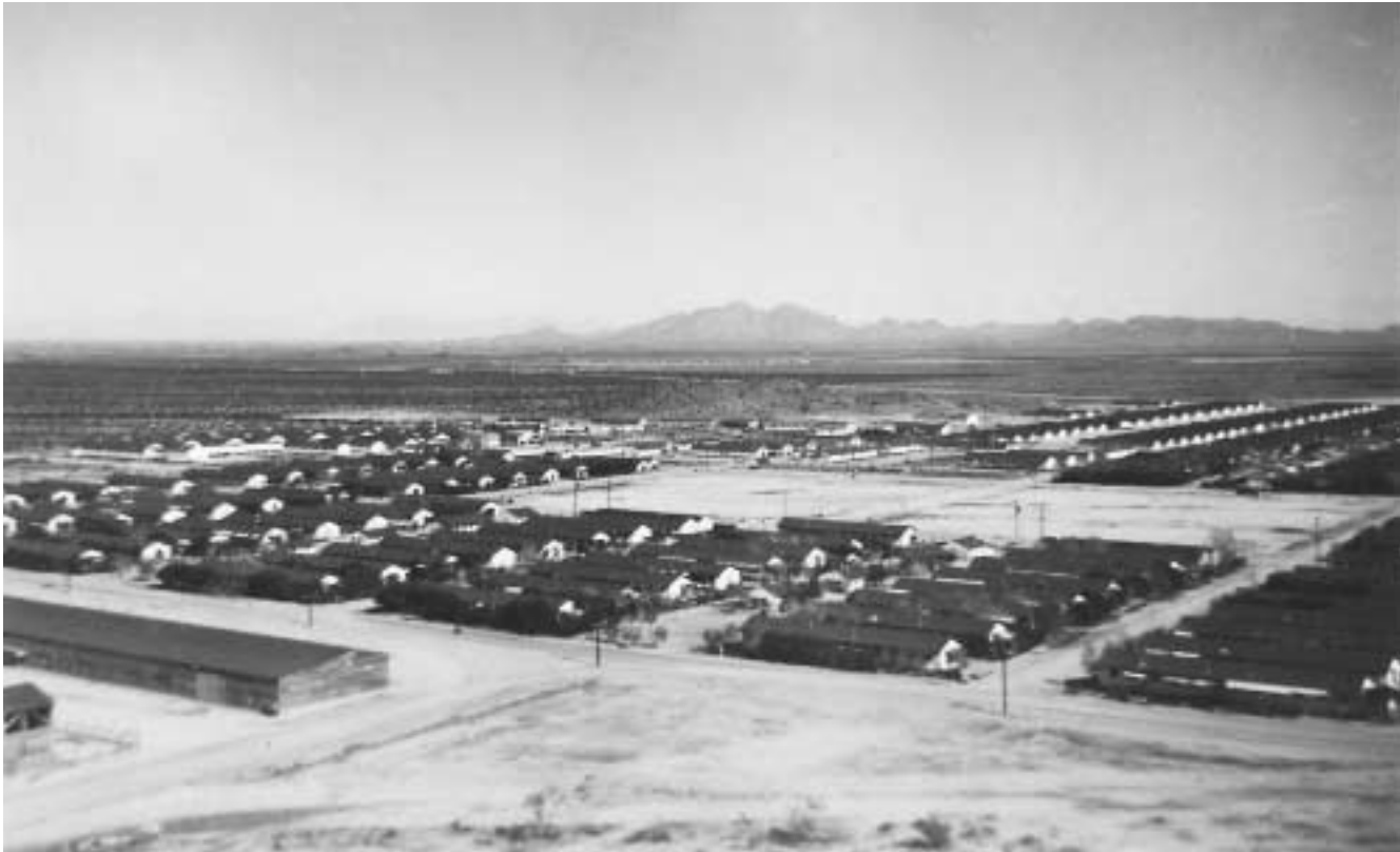
Gila River camp near Poston, Arizona, photographed by Tom Bodine in January 1945.

pendent heavily on each individual student's ability to pay for transportation and educational expenses; the system was far from need-blind. Forty percent of the applicants demonstrated scholarship need, a figure that greatly outstripped available funds. 35 The situation was made more difficult because some donors, especially religious groups, stipulated that their money could only be awarded to specific types of students; for example one Methodist Ladies' Club insisted that their scholarship be bestowed upon an "upright Methodist." 36 In a gross irony, many of the families who had substantial personal savings could not access them because the War Department had frozen their assets. Thus, Howard Beale's statement that, "I think insofar as the per student cost is necessary to move them all, it is justified as their [the Japanese students'] payment to democracy to keep democracy functioning in regard to this minority group," 37 seems especially callous. Financial limitations combined with the pressure to produce evidence of extraordinary loyalty—down to Boy Scout merit badges and church membership—probably dissuaded many students from applying at all.