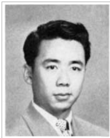
1949 STANFORD QUAD