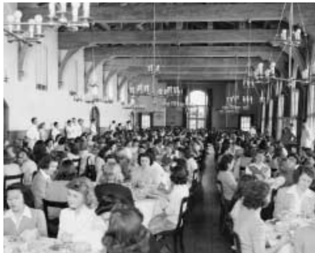
Lagunita Court's dining room: "Toward the end of the main course, at 7:40, the lights in the dining room went out...one candle was set upon each of the service tables, and the heavy curtains were drawn."