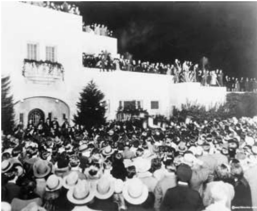
Community members salute Herbert Hoover at his campus home on election night, 1928.