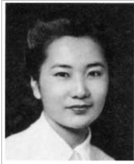
1941 STANFORD QUAD